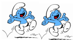
Happy Smurf Party