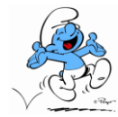
Independent Smurf Party

As King Smurf I choose the prime minister. Due to convention, I always pick the leader of the party that can command the confidence of the assembly as my prime minister.