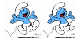
Communist Smurf Party