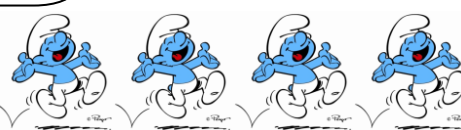
Smurf First Party

I am the leader of the Happy Smurf Party!