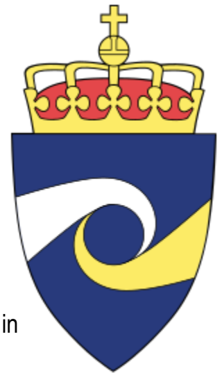
Emblem of the Norwegian Correctional System

Please include real examples that back up your beliefs. If you believe that human beings are naturally good or bad (or both), give some examples from things discussed in class, your own research, or personal experiences. You should have at least three examples to back up your opinion.