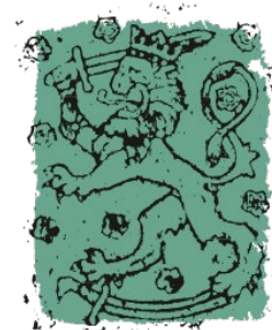
Emblem of the Finnish Ministry of Education and Culture