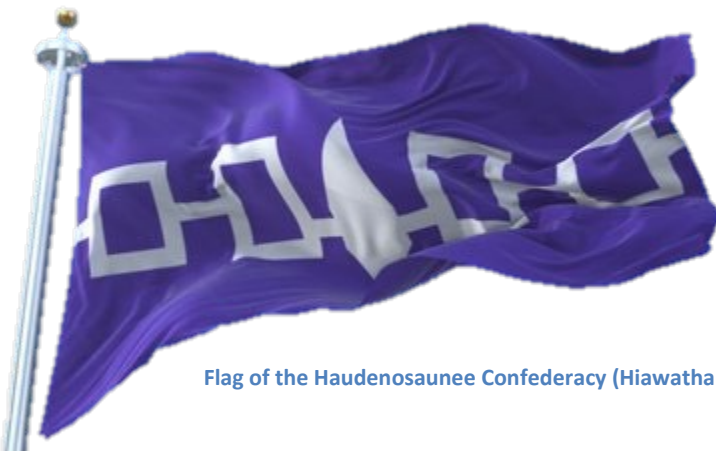
Flag of the Haudenosaunee Confederacy (Hiawatha Flag)