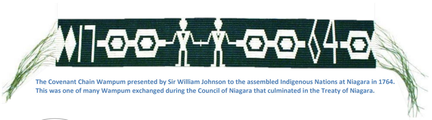
The Covenant Chain Wampum presented by Sir William Johnson to the assembled Indigenous Nations at Niagara in 1764. This was one of many Wampum exchanged during the Council of Niagara that culminated in the Treaty of Niagara.