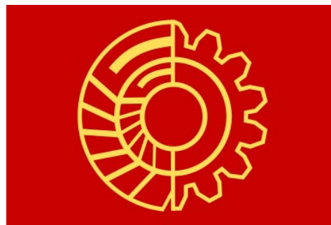
Communist Party of Canada